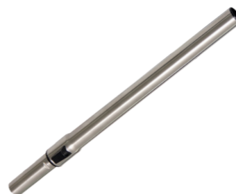
Telescopic tube stainless steel 0,6–1,0 m. Item no. 111.133