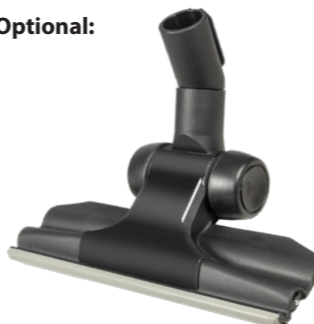
Flat floor nozzle 280 mm Item no. 119.126