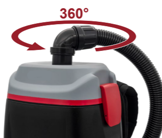
360° swivel joint, limitless manoeuvrability.