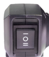
ECO mode with the battery version.