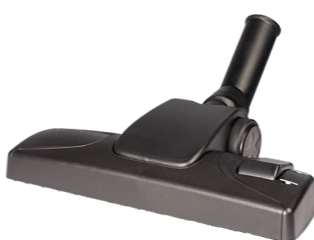
Combi nozzle 280 mm Item no. 114.114