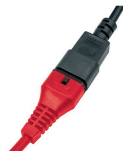
Integrated cable protection.