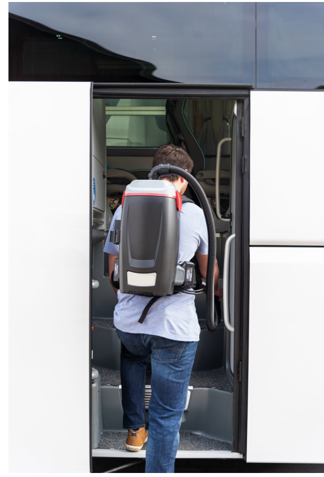
Perfect for narrow entrances, staircases and rooms.

Premium-quality and comfortable carrying system for both models.