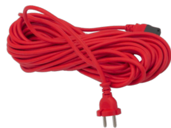
Power cord, 15 m pluggable.