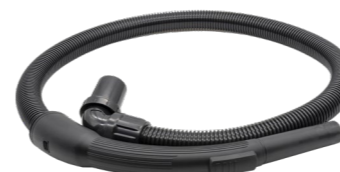
1.3 m suction hose. Item no. 119.124