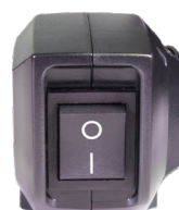
Easy-to-reach power button.