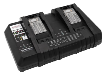
Fast charger. Item no. 119.120