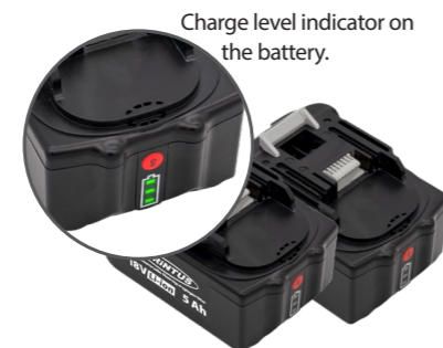
Charge level indicator on the battery.