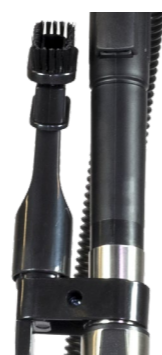
Convenient accessories storage.