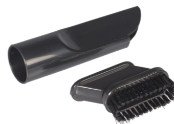
2-in-1 crevice-/upholstery nozzle. Item no. 115.127